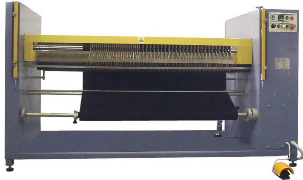
DETAIL OF REAR SIDE OF THE MACHINE