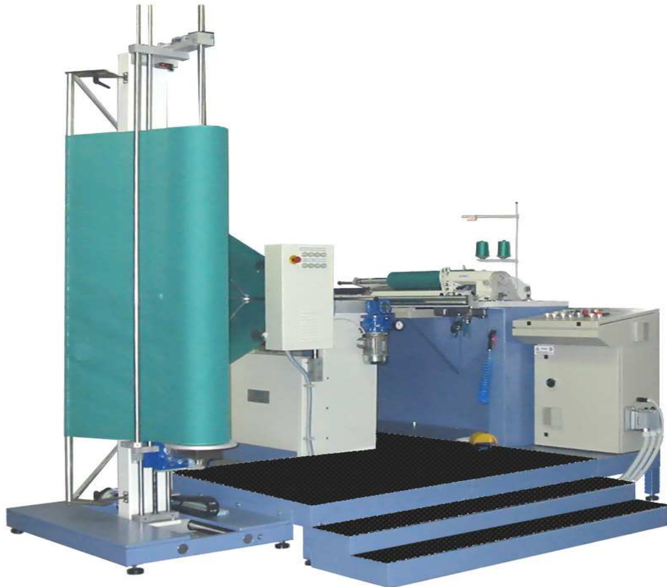
GCT/SYNCRO_2500 AUTOMATIC TUBESEWING MACHINE

A.M.P PISANI S.r.l. Via Ungaretti 6/8 27024 CILAVEGNA (PV) ITALY Phone ++39 0381/96128 Fax ++39 0381/969100 www.amppisani.com email: info@amppisani.com